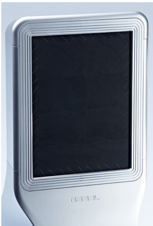
THE SO-CALLED RIGID "BENDING WAVE DRIVER" WAS PATENTED FOR GÖBEL HIGH END