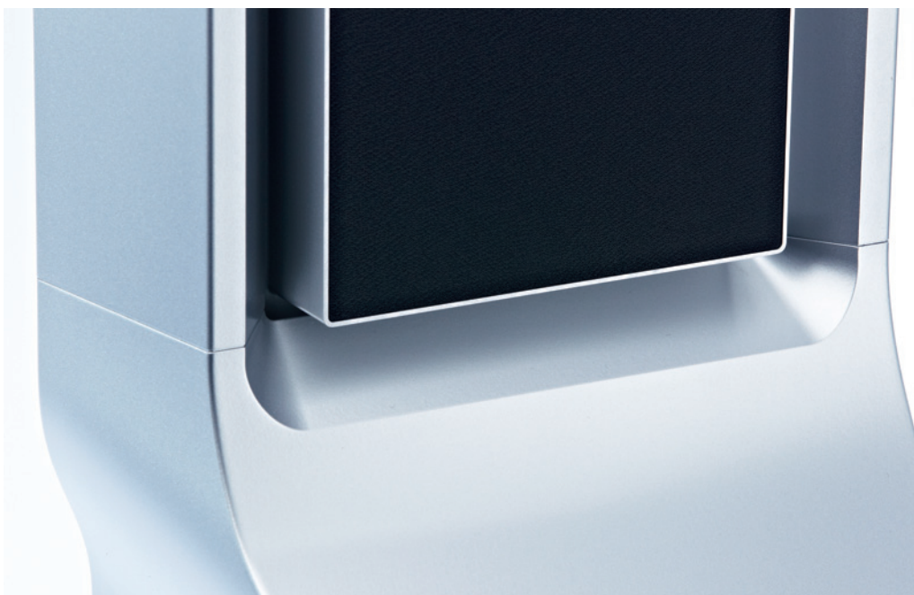
THE BACK OF THE BENDING WAVE DRIVER: THE DRIVER IS UNFORTUNATELY HIDDEN BENEATH THE BLACK, ACOUSTICALLY PERMEABLE PANEL. THE TOP OF THE LOUDSPEAKER WAS MACHINED OUT OF A 60 KG SOLID ALUMINUM BLOCK.