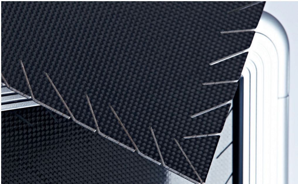
THE CORE MATERIAL OF THE DIAPHRAGM IS WOOD. THE INCISIONS COUNTERACT STANDING WAVE FIELDS.