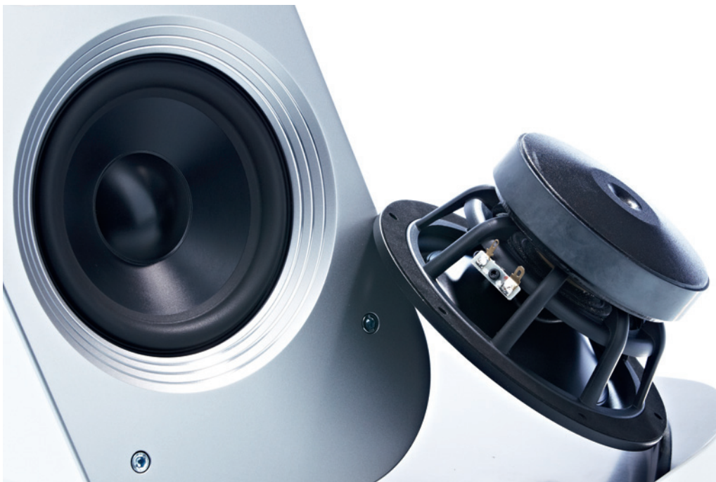
THE WOOFER IS CUSTOM MADE BY WAVECOR FOR USE IN THE EPOQUE SERIES

but made with a much higher quality epoxy resin. This material with a thickness of 20 mm can only be machined with diamond cutters. The 15 mm thick baffle, as well as the top of the speaker where the bending wave driver is mounted, is made of solid aluminum. The top element of the speaker is made from a 60 kilogram massive aluminum block – “Money was no object” when it came to the production cost in the development of the Epoque Series: It was only important to show what is sonically possible with the patented Göbel bending wave technology. During the nearly three years of development time for technology and design, the merely self-imposed restriction: In the total strive for perfection, the speaker must be living room friendly and not take up too much space. You can see at first glance that this was 100% accomplished with the Fine, and the placement of second bass module array above the bending wave driver looks like an interesting technical sculpture, not like a clumsy speaker – of course given the appropriate ceiling height.